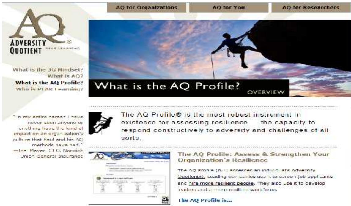
Figure 1: An Overview of Adversity Quotient Profile

The figure gives an insight of AQ Profile (8.1) and provides guidelines as how an Individual's AQ can be measured through online test and how leading companies use it as a robust tool to screen job applicants and hire more resilient people who have the capacity to respond constructively to adversity and challenges of all sorts.