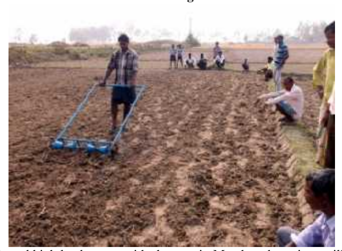
Sowing of Jute

Jute requires a warm and humid climate with temperature between 24° C to 37° C. Constant rain or water-logging is harmful. The gray alluvial soil of good depth, receiving salt from annual floods, is the best for jute. Flow ever jute is grown widely in sandy loams and clay loams.